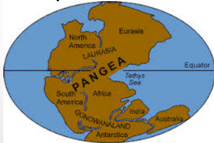
Pangea—250 million years ago

Wegener suggested that all the continents were joined together as one large supercontinent at some point in the past.